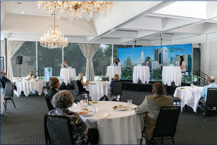
Distanced and engaged.