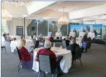
Spacing allowed for three panelists and moderator.