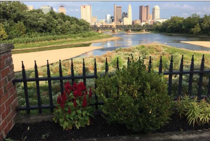
A limited number of people will again enjoy this beautiful view of the city skyline from the Boat House on June 10 as they attend the CMC forum.