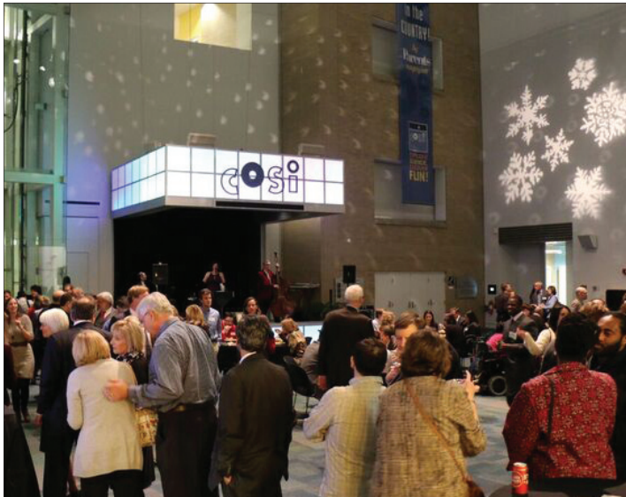
CMC welcomed new talent from area universities at the party at COSI.