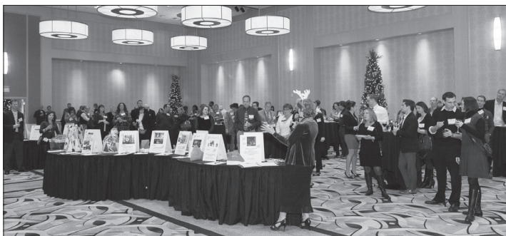
Food and fun at Jingle Mingle