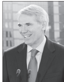
Ohio's U.S. Senator Rob Portman