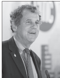
Ohio's U.S. Senator Sherrod Brown

Political forums presented debates about the tax levies for the Columbus Schools and the Columbus zoo. Columbus' elected officials and those running for office including Ohio's U.S. senators, Sherrod Brown and Rob Portman, and each of Ohio's gubernatorial candidates addressed