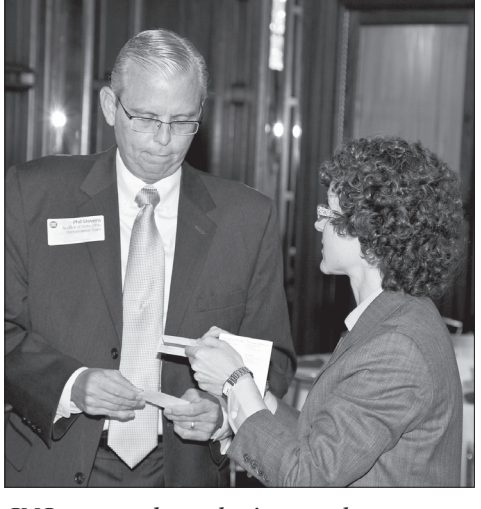
CMC guests exchange business cards.

View CMC forum videos in their entirety at