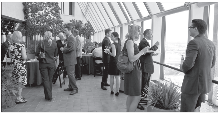
Everyone enjoyed the 30th floor atrium view.