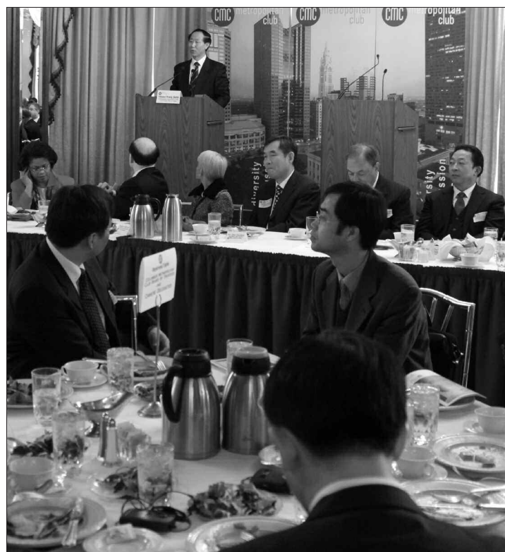
Speaker Minister Wang Jiarui.