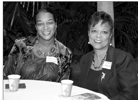
Happy faces from Jingle Mingle!