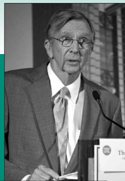
Right: Governor Ted Strickland