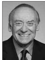
Lee Fisher, Lt. Governor, State of Ohio