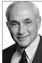
Leslie Wexner, Founder of Limited Brands

Series sponsored by Sequent ; this forum supported by Bricker & Eckler and Limited Brands .