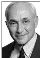
Leslie Wexner, Founder of Limited Brands

Throughout the series, we'll hear from the founders, the first-person, behind-the-scenes stories of the birth of their businesses and the incredible journeys businesses have taken to become Columbus' well-known successes.