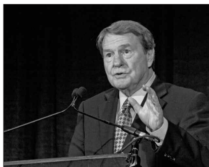
Speaker Jim Lehrer