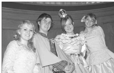
Performers from the Hans Christian Andersen Theatrical Troupe.

"This morning, I had the pleasure of listening to people from Columbus speaking of the same goals as Odense; the cooperation between the university, the science community and business to attract and keep highly educated people — good tax payers — to the city."