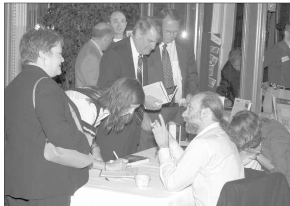
Speaker and author Bruce Schneier signs his book after the forum

Bruce Schneier, author of Beyond Fear: Thinking Sensibly About Security in an Uncertain World