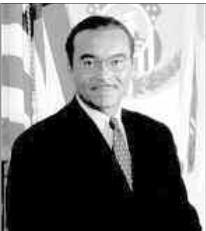
Mayor Michael B. Coleman

Mayor Michael B. Coleman Friday, September 16 Noon to 1:15 at the Athletic Club of Columbus