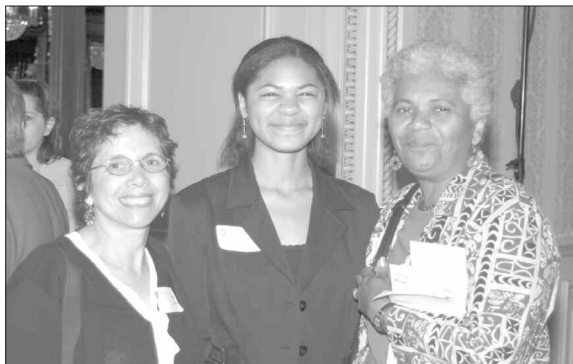
CMC guests after the forum

"You know, StoryCorps is such a simple idea - I mean it's just so basic. It's you and a family mem- ber and a microphone. Part of the magic is that it's really a project about getting people to listen to one another, which is so important in this day and time in particular."