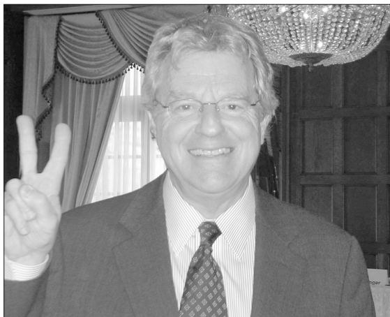
Speaker Jerry Springer

“I believe health insurance is the key to everything in America. It's one-third the cost of hiring an employee. How do we change it? Pass a law; every citizen has to have health insurance, and then we subsidize it. Now Ohio is the cheapest place to do business. Then we have more employers and that means more taxes.”