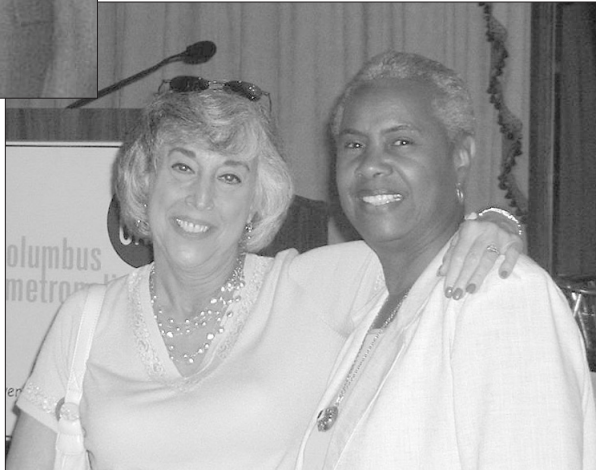
CMC members after the forum.

Check the forums YOU will be attending in the circle. Write the NUMBER OF GUESTS attending in the square.